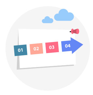
Is a public roadmap prominently posted?

Choosing to embed analytics vs. building your own is a big decision, and you need to make sure your vendor is innovating and delivering value as fast as your customers will be asking for it. Having a public, up-to-date roadmap gives you the peace of mind and assurance that your vendor is working just as hard as you are to deliver value to your customers. When reviewing your vendor's website, look for these signs: