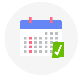
Is the roadmap up to date?