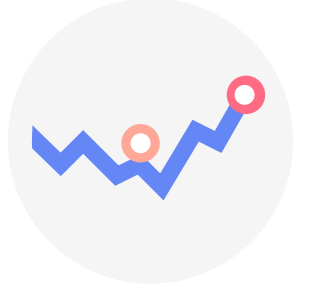
Do they show success in delivery on previous roadmap commitments?

Knowing where your embedded analytics vendor is placing their bets via their public roadmap lets you plan and schedule your releases and feature rollouts, but most of all it should give you peace of mind that your subscription is delivering value.